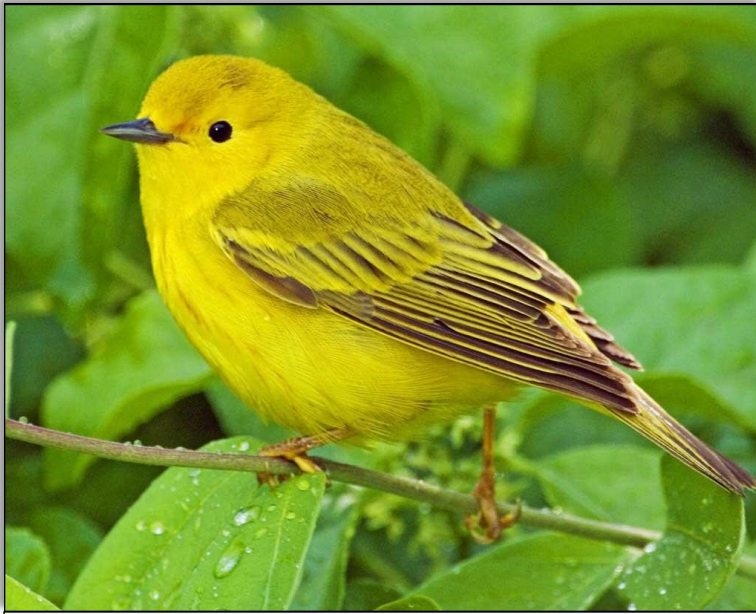
A yellow warbler bird.

their wintering grounds in Mexico and Central America. All of our native trees, especially the oaks, willows and wild cherries, host a good number of caterpillars, spiders and insect larvae that these migrating warblers need to replenish the fat reserves sequestered under their breasts and wings. Imagine flying across the Gulf of Mexico and not having enough protein!