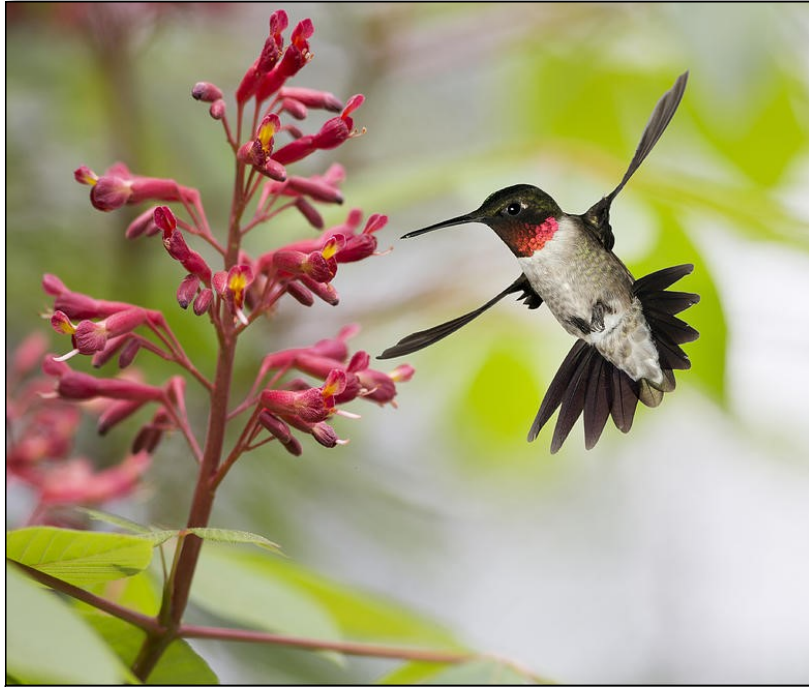
A ruby throated hummingbird collects nectar from a red buckeye flower.

the American Goldfinch, the House and Purple Finches benefit! Nothing attracts seed eaters like finches than the dried seedheads of coneflowers, goldenrods, or sunflowers. Birds' bones are hollow, so