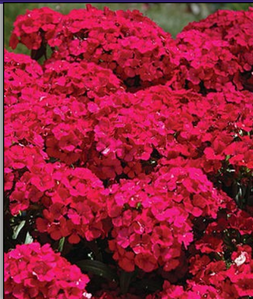
Jolt Dianthus Cherry

There are three colors in the Jolt series: Jolt Cherry, Jolt Pink and Jolt Pink Magic.