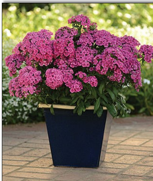
Jolt Dianthus Pink

Moreover, Jolt dianthus is one of the most heat-tolerant interspecific dianthus we have, making it a perfect addition to your Louisiana landscape. Jolt dianthus will continue to bloom into the early summer months, giving you that extra push to carry your landscape into the warm season. Jolt dianthus can be planted in early fall in Louisiana landscapes. Like most bedding plants, they are susceptible to