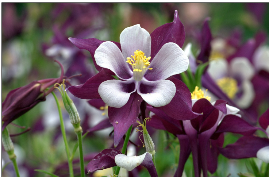
Violet and white Swan Columbine.