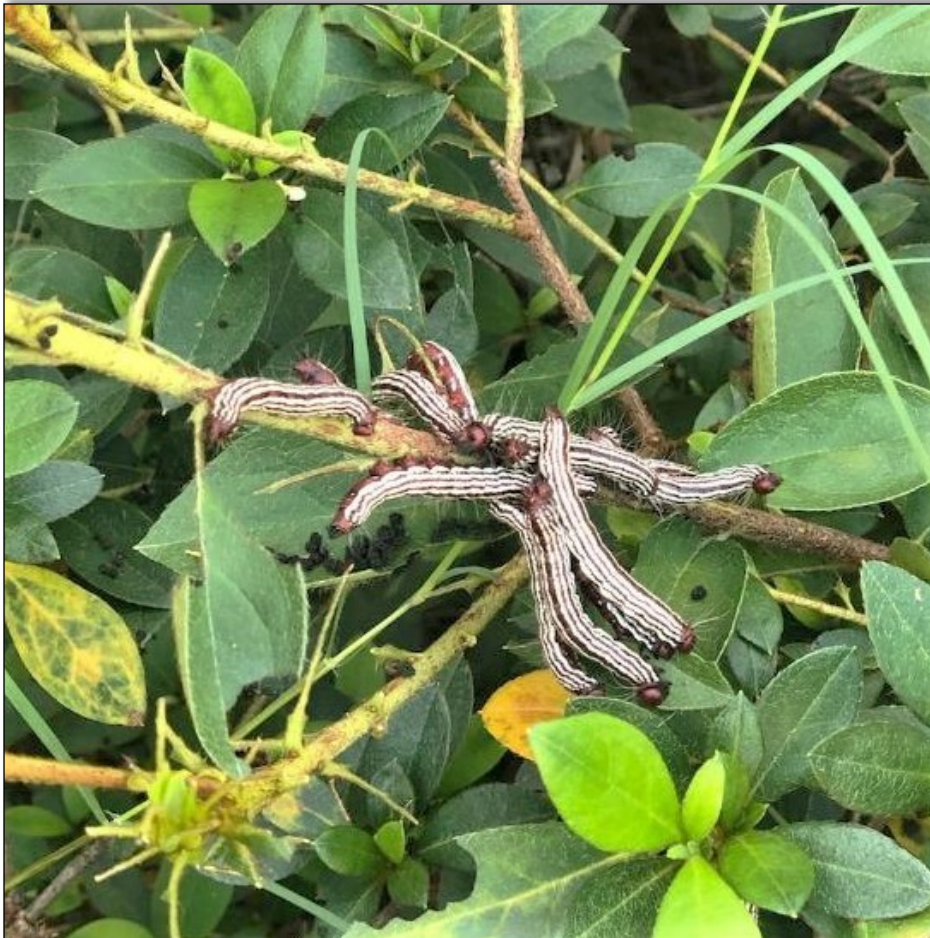
Red Headed Azalea Caterpillar Datana major feeding on an azalea bush.

If you have to control these pests, there are several simple options. Manual removal by knocking them off of the azalea and into a plastic bag works. Tie the bag and trash it. Sprays formulated to control caterpillars and other soft-bodied insects also provide an effective