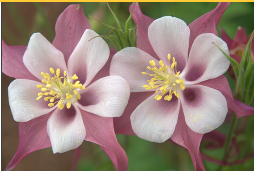
Lavendar and white Swan Columbine.

*Remember, plant Swan Columbine in mid to late fall (October-December).