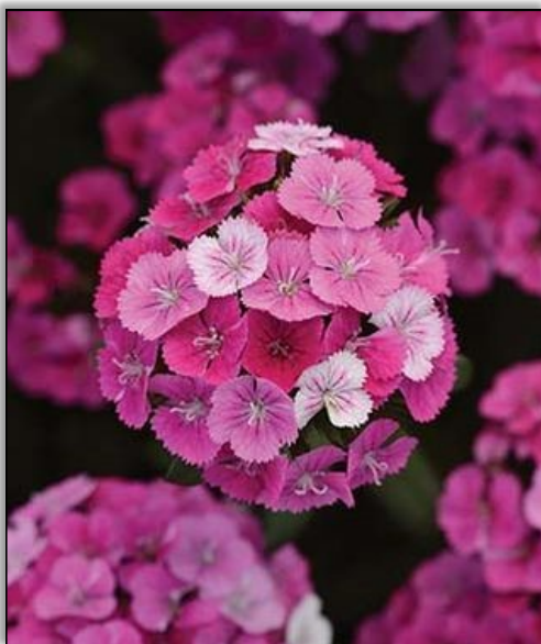
Jolt Dianthus Pink Magic